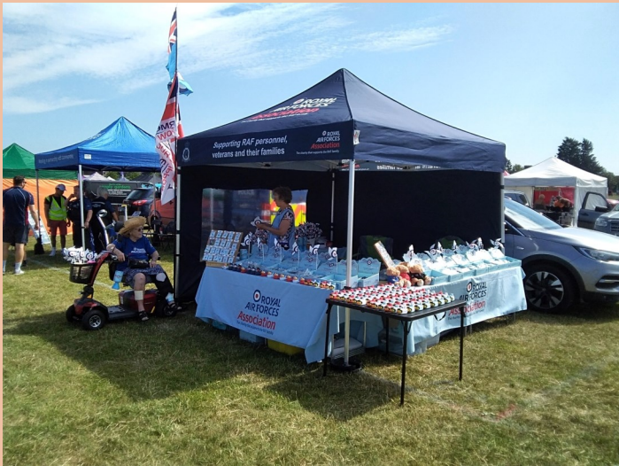
All set and ready to sell those "Wokka Wokka" 2023 Ducks at the Thatcham Families Fun Day raising nearly £600 on the day.

Three consecutive weekends in June saw branch members, ably assisted by wives and members of the ATC out representing the RAF Association whilst collecting for the Wings Appeal 2023. Raising over £1,000 for the branch's Wings Appeal 2023 meant it was 3 well worked days out. With Wings Week still to come in September, along with the money raised by the Dirty Half Dozen, 2023 looks as if it could be a record year for the Global Branch on the fundraising stakes.